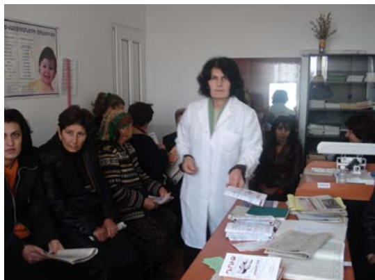
Medical worker distributing information materials during awareness raising session, Armavir, Armenia

These presentations were organized with the support of the Ministry of Labour and Social Issues and Women and Children Rights Protection departments of the marz authorities. During these presentations awareness raising materials were distributed to audiences who greatly valued the importance of education and information events in this field conducted on the regional levels. As mentioned by one of the participants, "Quite often we are isolated from Yerevan, the capital of the country which is also a capital of information and communication. Events like this help to close existing information and communication gaps and to keep us informed about existing trends in development of social life in our country."