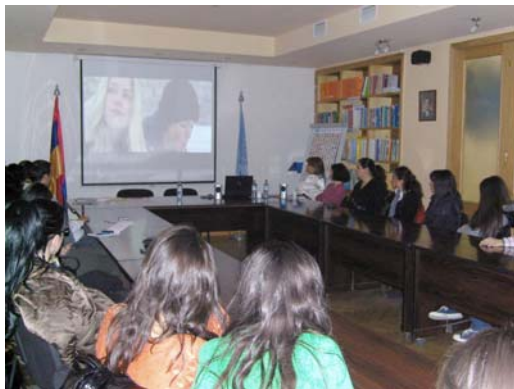
Film screening during one of the conducted meetings with students in marzes

Since youth was one of the prioritized target audiences towards whom UNFPA CGBV project directed strategic messages of the “16 Days of Activism against Gender Violence” campaign, it was essential to design and conduct events for them in a way that would ensure atmosphere of trust, openness and readiness to participate in discussions on the topic of violence against women.