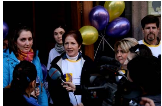
Ms. Marie Yovanovitch, US Ambassador to Armenia, giving interview to Armenian journalists