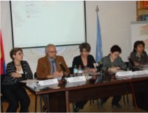
December 2: celebrating International Day for Abolition of Slavery