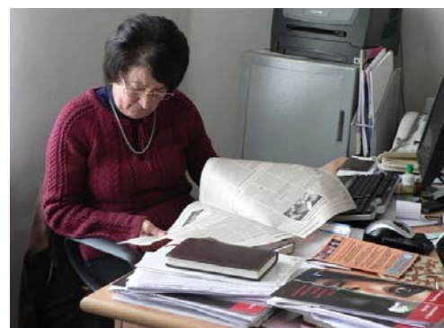
One of the participants screening through distributed awareness raising materials at her work place at marzpetaran

Within the framework of the “16 Days of Activism against Gender Violence” campaign, presentations were conducted in the regional (marz) administration centers of Aragatsotn, Ararat, Armavir, Gegharkunik, Kotayk, Lori, Shirak, Syunik, Tavush, and Vayots Dzor marzes, for the target groups of local authorities, journalists of regional newspapers, and civil society representatives to provide overview of the 16 Days campaign, its origins, as well as all to raise awareness on gender issues in Armenia, including all forms of violence against women.