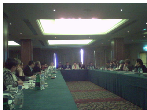
At the public hearing of the Draft Law on Domestic Violence

This event became an important preparatory advocacy initiative in support of the future presentation and discussions of the draft law in the National Assembly. Public hearing hosted representatives of the relevant state legislative and law enforcement bodies as well as civil society organizations, working in the field of women's rights protection and promotion, RH and PD issues. During the hearing, participants had a chance to share their opinions and make suggestions and recommendations concerning the presented Draft Law which will be incorporated in the document prior to putting it on the National Assembly agenda.