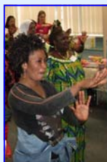
Women's Health at work