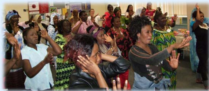
Participants learning the finer points of self defence

The 'Big Day Off' was held on 8 November at Parramatta Town Hall provided an opportunity for the Women's Health at Work Program (WHAW - Sydney West Area Health) to bring together fifty (50) women of Sudanese, Sierra Leone, Liberian and Ethiopian backgrounds. This action packed day included two workshops, which focussed on women's health and chronic disease prevention through eating a healthy diet, a self defence demonstration with women practising the techniques, lunch, door prizes and music. The women and staff thoroughly enjoyed the day and new information, flyers and ideas were gathered by the women at the end of the day.