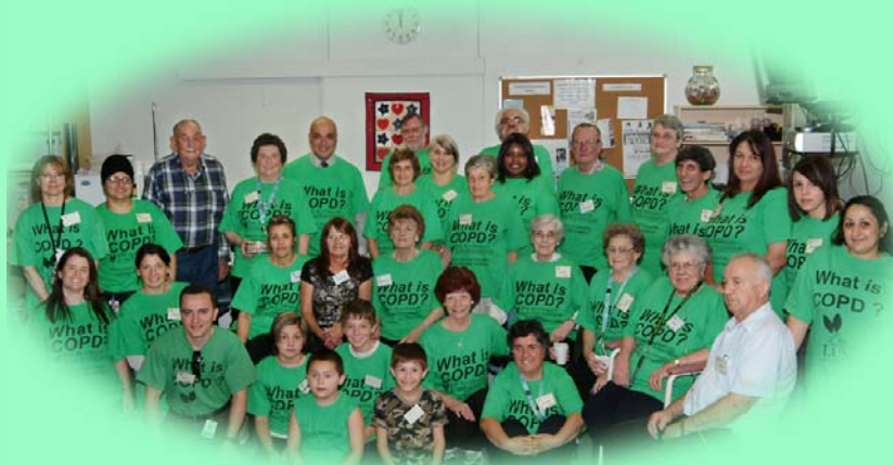
A sea of green could be seen walking around Westmead Hospital

For more information, call RAC on 9881 7480.