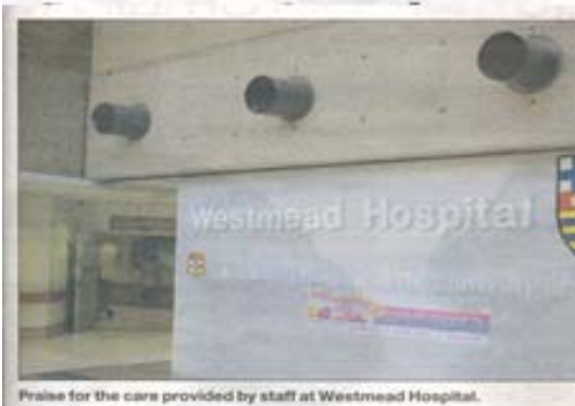
Praise for the care provided by staff at Westmead Hospital.