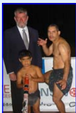
Launch of Aboriginal Action Plan