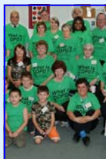
World COPD Day