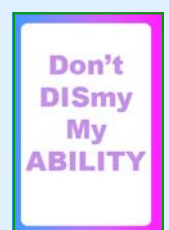
Presentation and Awards