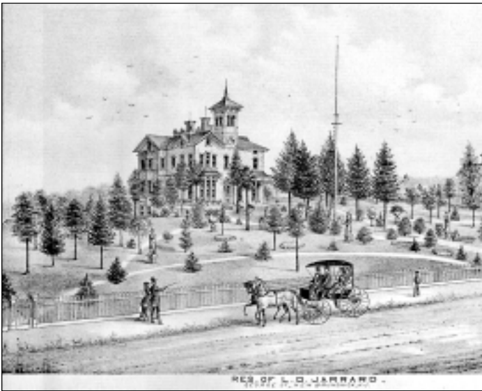
College Hall in the 1800s