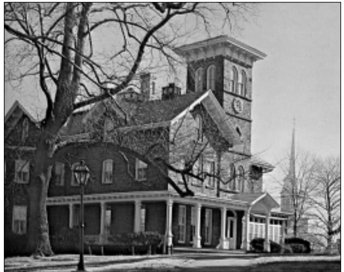
College Hall today